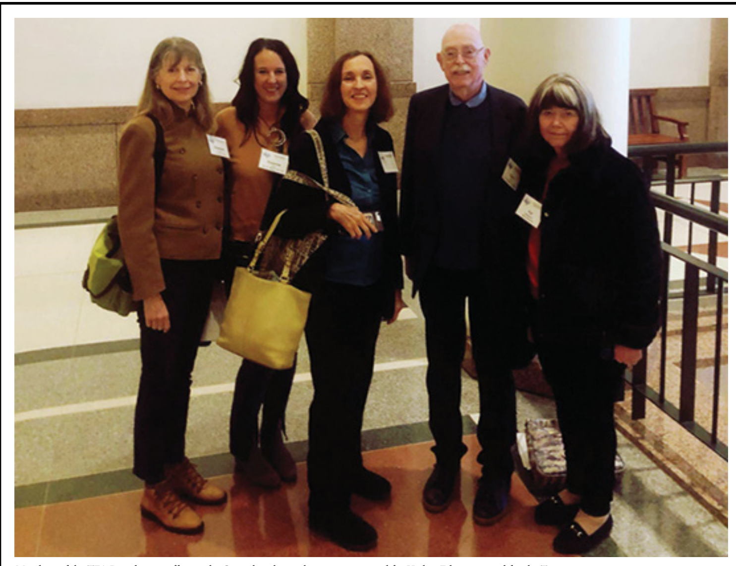
Members of the TFA Board met staffers at the Capitol to share why tenure is crucial for Higher Education and for the Texas economy.